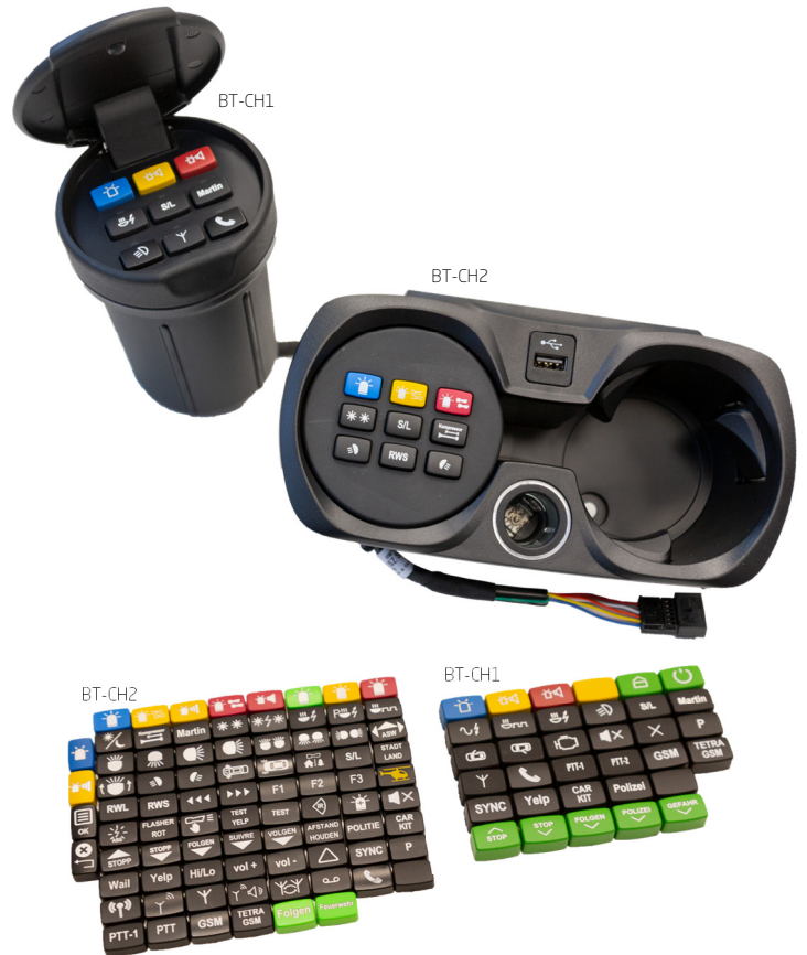
Available keycaps (will be extended if required)