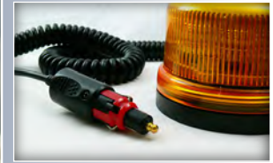
Power Magnetic Mount European coil cord and cigar-plug