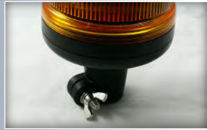
DIN pole Mount