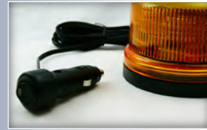
Magnetic Mount Straight cord with single button cigar-plug