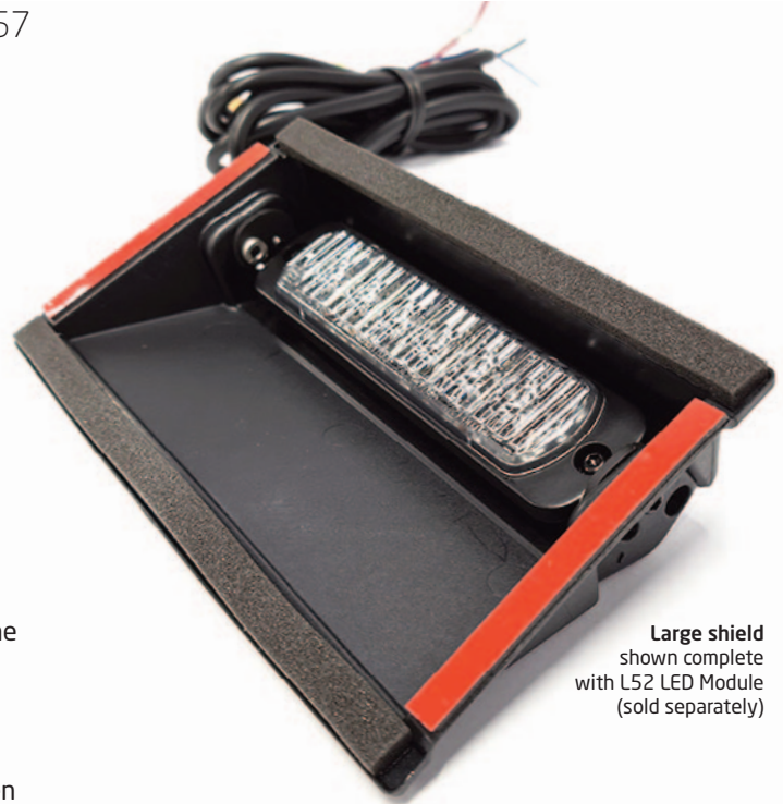
Large shield shown complete with L52 LED Module (sold separately)

The L52 Adjustable Window Shield combines flexibility and functionality to meet the demands of modern vehicle lighting solutions.