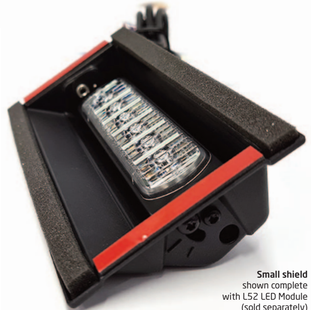
Small shield shown complete with L52 LED Module (sold separately)